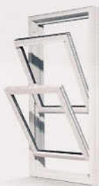
Double-Hung Window (single-hung window also available)