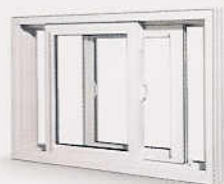
Double-Slider Window (single-slider window also available)

SYSTEM BOREAL™ slider and double-hung windows. The smooth sliding sash can be tilted or removed for easy cleaning.